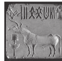
Figure: Indus Valley Seals