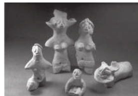
Figure: Terracotta Toys