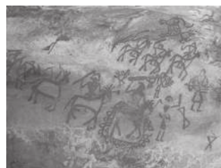
Figure: Bhimbhetka Rock Paintings